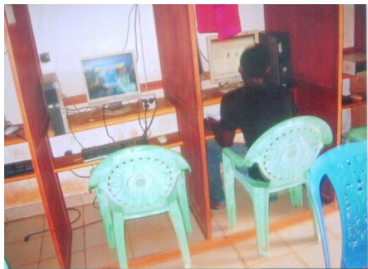
At left, the IT school, and below, children from St. Augustine's school, Yaounde, Cameroon.