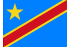
République Démocratique du Congo