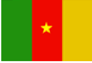
Republic of Cameroon