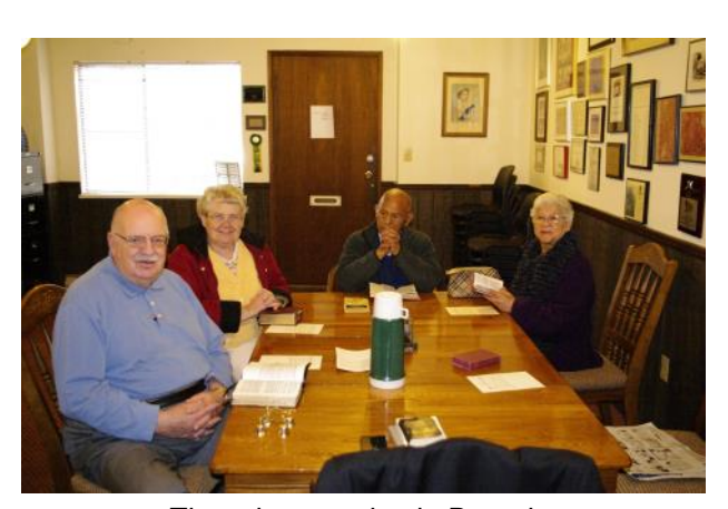
Thursday morning in Burnaby