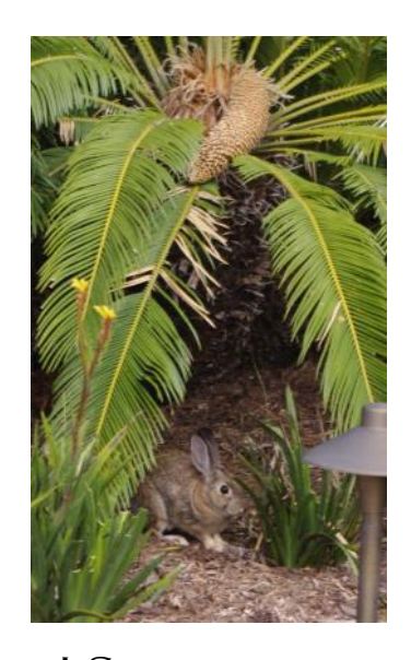
A SYNOD GUEST

After Synod was over, I spent some time in British Columbia from October 26— (Continued on page 4)