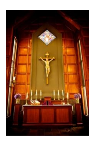
ALTAR AT ST. MATTHEW'S, NEWPORT BEACH

If you want advice as to the path to follow in your situation, the good folk at St. Matthew's are only too ready to help with advice that has stood the test of experience.