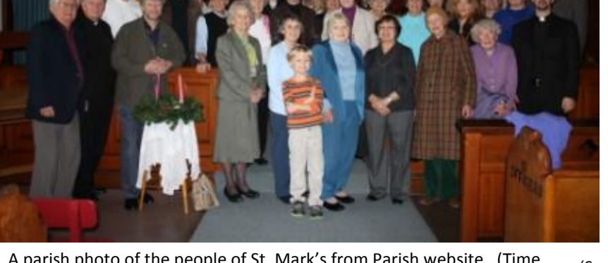
A parish photo of the people of St. Mark's from Parish website. (Time constraints did not allow a new picture)(

The parish rents the use of the historic Church St. Saviour's Henry St. in West Victoria.