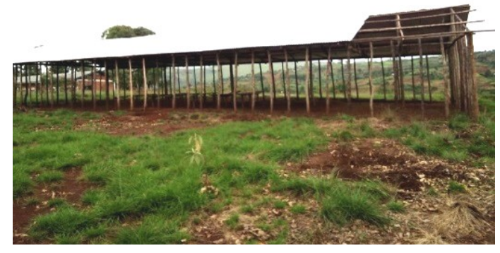
ST. AUGUSTIN WALUNGU MISSION.