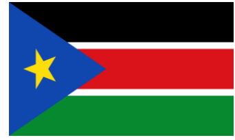
Republic of South Sudan