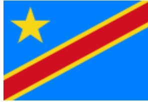
République Démocratique du Congo