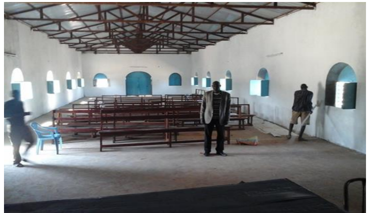
The interior of the new Cathedral in South Sudan