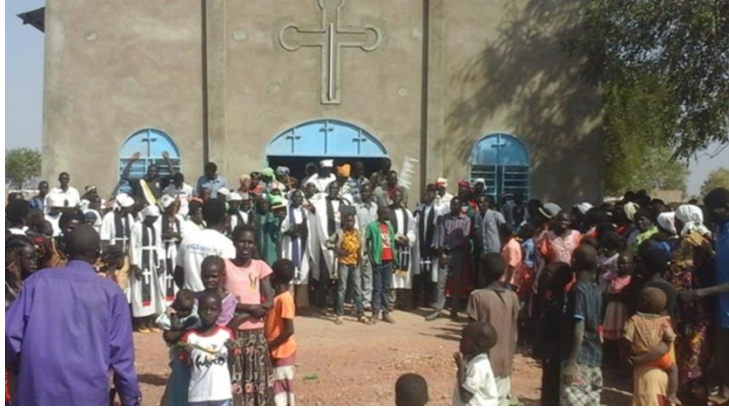
Above - Throngs attend services at the new Cathedral in South Sudan