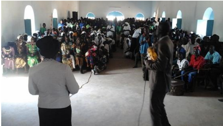
The faithful fill the Cathedral - standing room only at the back

The Bishop describes the situation in South Sudan, “Thousands of people are starving and many are sick and there is fear that many will lose their lives as a result of starvation and diseases if nothing is done. So we need to pray for God’s intervention to let the needs be known. We thank God for the peace and we need to pray for reconciliation, forgiveness and lasting peace in South Sudan. Parts of the team of the rebels arrived Juba in December and some are expected this month and the formation of unity government needs to be done this month. There is economic crisis in the country which needs prayers for God’s intervention.”