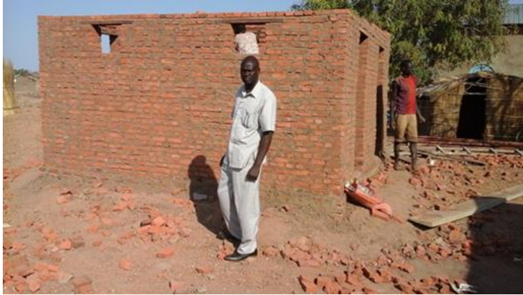
Newly constructed toilet block in South Sudan

A major concern for the health of people living in very primitive conditions is the need for hygienic treatment of waste matter. In Central and East Africa, the second major cause of sickness (after malaria) is dysentery which is directly related to a lack of clean drinking water and a lack of toilet facilities. The people of Aweil, with financial help from