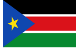
Republic of South Sudan