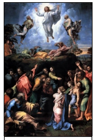
Raphael, c. 1520

It was a common belief that God only existed in the world of the dead (Matthew 22:32). The Transfiguration, however, counters this idea in that we witness God as not just ' the God of the dead, but the God of the living '. Even though Moses had died and Elijah had been taken up to heaven (2 Kings 2:11), they both <u>now live</u> in the presence of Jesus, the Son of God; and this Grace applies to all who face eventual death, as long as they have faith. As the early Church Father Origen points out, the Transfiguration and the Resurrection are a glorified state demonstrating God's action in the world through