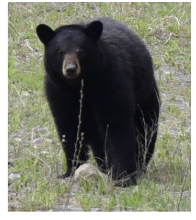
SEEN ALONG THE LOGGING ROAD EN ROUTE TO CHAPLEAU FOR SERVICE-I.E., WE WERE EN ROUTE FOR THE SERVICE, THE BEAR DID NOT MAKE IT.