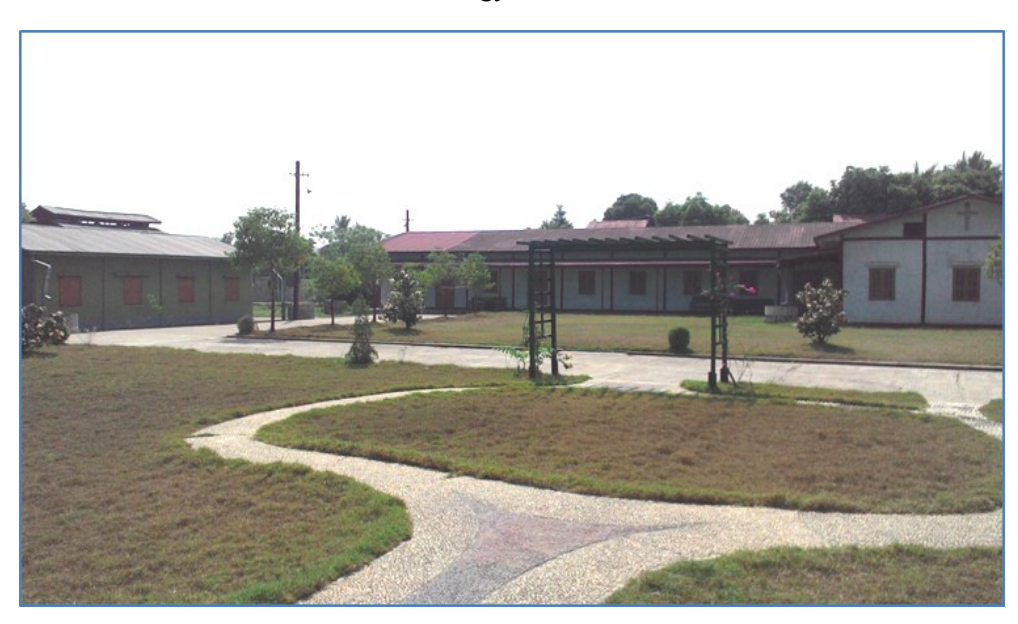
COMPOUND OF EVANGELICAL BIBLE SEMINARY, YANGON

On February 20, 2016, the EBS held its 27<sup>th</sup> annual graduation service; since its inception, the EBS has graduated 400 students. This year 15 students graduated: three with a Master of Divinity, six with a Bachelor of Theology, and six with a Diploma in Theology.