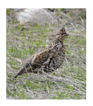
RUFFED GROUSE ALONG THE WAY