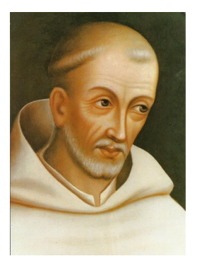
ST. BERNARD OF CLAIRVAUX 1090–20/08/1153