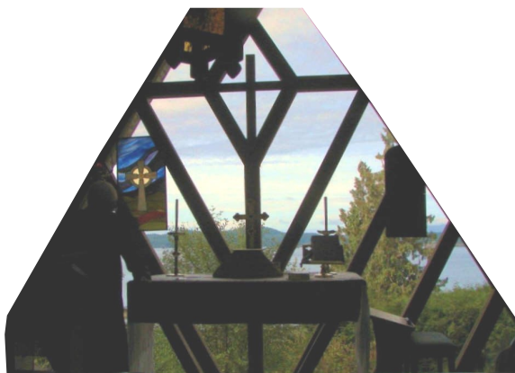
THE ALTAR AT ST. COLUMBA OF IONA