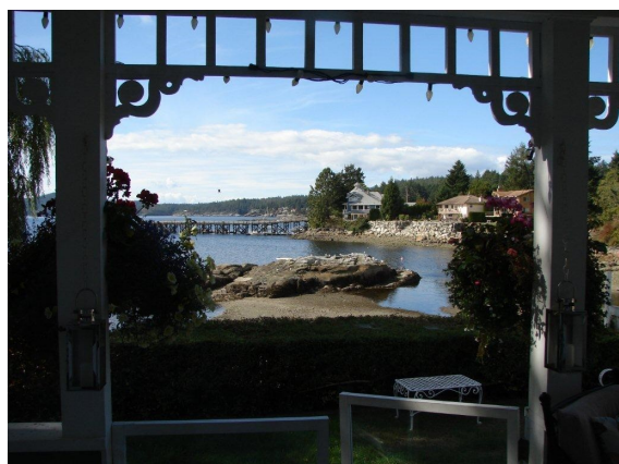
VIEW FROM THE WILLCOX HOME