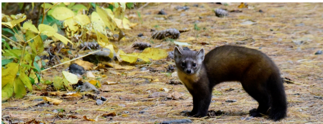
Pine Marten — Algonquin Park